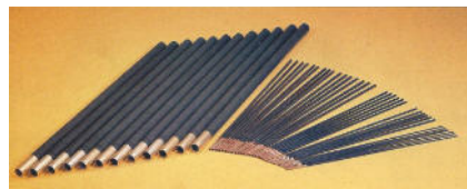
Ground plane elements, AB-21, AB-22, AB-23, AB-24/GR, and mast sections AB-35/TR-7, for Antenna Eqpt. RC-292