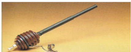
AB-15/GR Antenna Base for Elements MS-116A, 117A & 118A Elements, for installation on vehicle or as fixed antenna