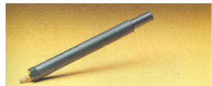
Support Antenna AB-591/PRC-25, is a rigid tubular support for Antenna AT-271/PRC