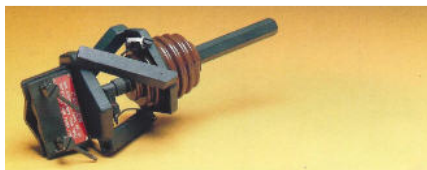
MP-68 Antenna Base is comprised of ceramic feed through insulator, sockets for elements, adpopter M-359 and a vise.