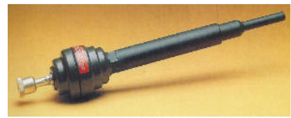
AB-652/GR Antenna Base used for such a high-output Radio Transceivers as AN/GRC-106 etc.